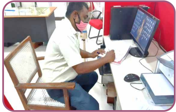
नोटिंग एवं ड्राफ्टिंग प्रतियोगिता - 03-09-2020