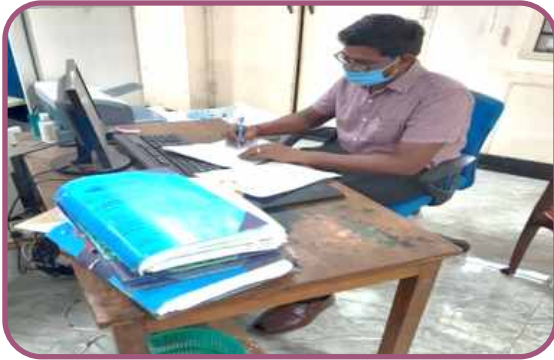
हिन्दी सुलेख प्रतियोगिता - 07-09-2020