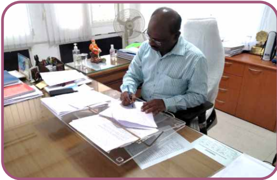
विभागाध्यक्षों के लिए हिन्दी सुलेख प्रतियोगिता - 08-09-2020