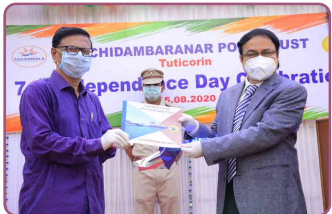
The Officers and Staff who rendered meritorious services during this ongoing COVID-19 Pandemic being appreciated by giving standing ovation on the occasion of Independence Day celebrations on 15.08.2020