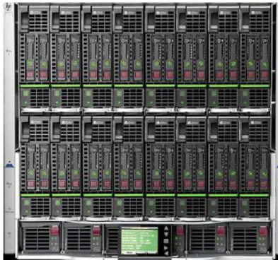
HP C7000 Chassis Enclosure