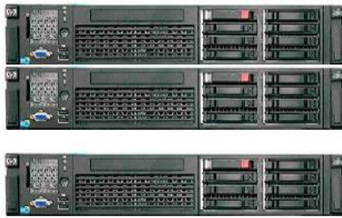
SAP Servers – 3 No's HP RX 2800 i2