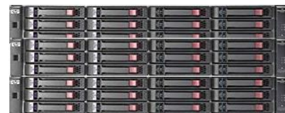
Storage (HP P2000 G3)